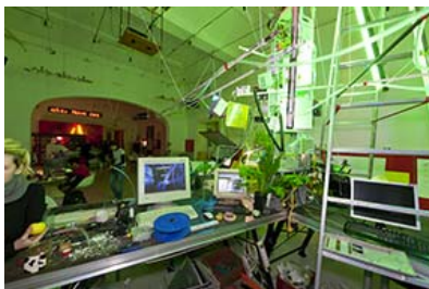
BIOMOD Workshop and Installation,