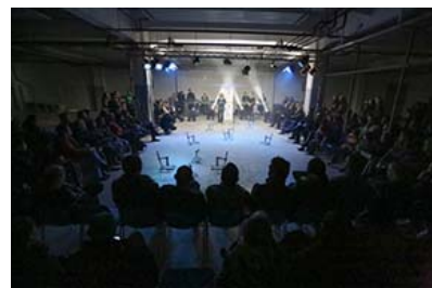
Performance, L P Demers, Soft Control, KIBLIX 2012