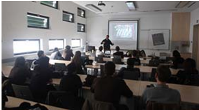
Lectures, KIBLIX 2011