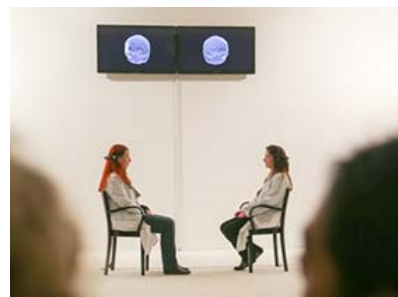
Installation, Marina Abramović, Soft Control, KIBLIX 2012