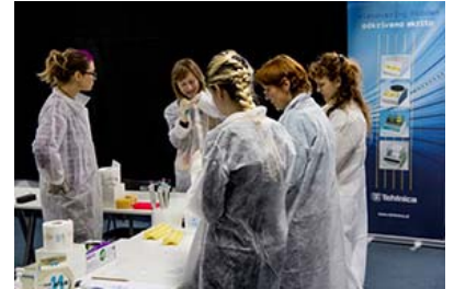
Workshopology, DNK, Soft Control, KIBLIX 2012