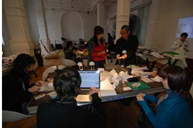
Workshopology, KIBLIX 2011