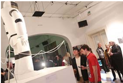
Robots&Avatars Exhibition, KIBLIX 2012