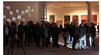
Inauguration exhibition, MRFU-KIBLIX 2013