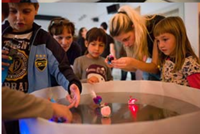
Workshopology, Robots&Avatars, KIBLIX 2012

rich accompanying program: the first called »Robots and Avatars« and second »Soft Control«. With those two concepts we addressed two different aspects: the impact of science and technology on the social life of the individual, and an in-depth research into the secrets of science, which holds the key to our future. Both came up with numerous solutions to bridge the powerlessness of the individual in contemporary society. During three months with three large scale exhibitions, international conference and symposium, more than 40 workshops, etc., and more than 100 collaborating artists and experts from all over the globe, it represented one of the key event of it's kind in the region.