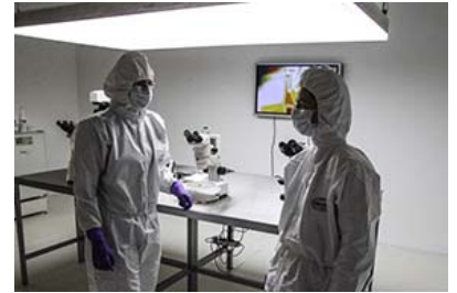
Instalation, Polna Tratnik,Soft Control, KIBLIX 2012