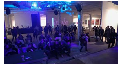
Public Performances, MRFU-KIBLIX 2013