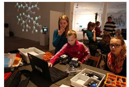
Workshopology, MRFU-KIBLIX 2013